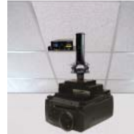
The NB-UIM Anti Vibration Adaptor shown installed 3" above the Projector's Mount