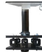
Ceiling Plate Comes with NB-UIM-W-96 & with NB-UIM-96 & Safety Cable