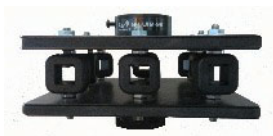
UIM-96-W-PM attached to a 1½" dia pole