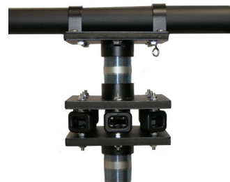
Ceiling Plate Comes Complete with NB-UIM-W-96 with NB-UIM-96 in Black or White & Safety Cable

Please turn over for further information and Pricing