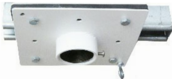
Ceiling Plate attached to Unistrut