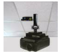
The NB-UIM Anti-Vibration Adaptor shown installed 3" above a projector's Mount.

All Ship completely assembled for instant attachment to the Projector's 1 1/2" Dia Pole