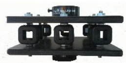
Exploded view of the NB-UIM-96-US attached to Unistrut