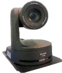
Panasonic Camera shown mounted on the Tripod Platform