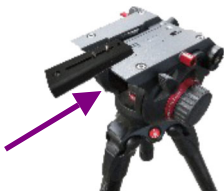
For illustration purposes, the platform has been removed to show how the Quick Release Plate slides on to the Tripod's Head and then locked into Place