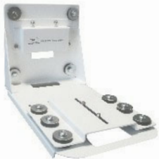
Wall Mount Bracket with Camera removed