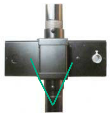
All Plenum Boxes come with Alternate Conduit Access Points

Rear View of Junior Plenum Equipment Box with Double Pole Mount Fitting