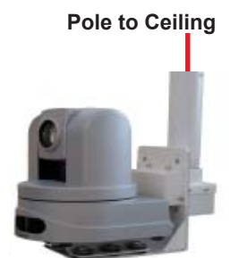
Pole to Ceiling