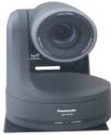
The Clean design of the Universal Multi-Camera Mounting Bracket is usually hidden by the Camera itself