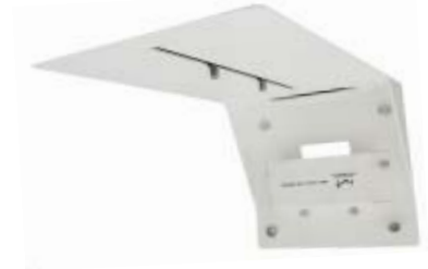
The Multi-Camera Mounting Bracket can be installed in either in a Normal or Inversed