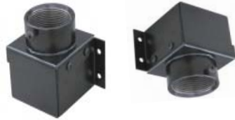
Pole Mounting Adaptor attaches to the Back Plate