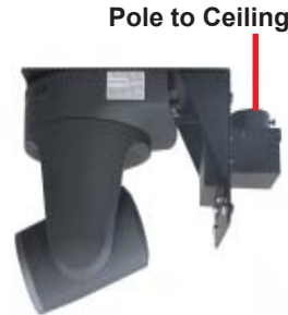
Pole to Ceiling