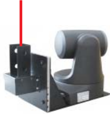
Using the Unistrut® Mounting Back Plate to attach the Multi-Camera Mounting Bracket to other Unistrut® fittings