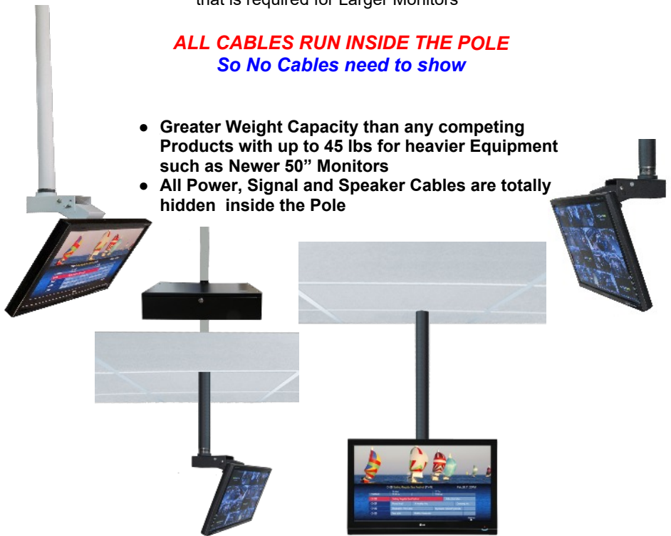
Can be connected directly with any of our Pole Mount or Surface Mount Plenum Boxes

Pole Mounting Bracket with 25-100 mm VESA Plate Black Pole Mount Bracket with 25-100 mm VESA Plate White VESA Extension 200-400 Plate (Black Only)