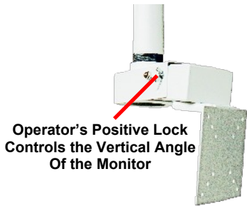
Operator's Positive Lock Controls the Vertical Angle Of the Monitor

Our New Pole Mount Monitor Bracket Solves the Problem by Allowing the Monitor to be be Placed Anywhere in a Room