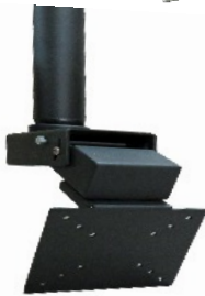
Fully Adjustable Compact Size of 6"x 3" Available in White or Black Powder Coat Finish