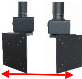
Easy 90° Horizontal Adjustment