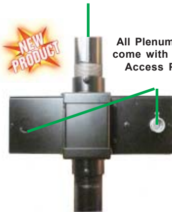
Rear View of Junior Plenum Equipment Box with Double Pole Mount Fitting

All Plenum Boxes come with Conduit Access Points