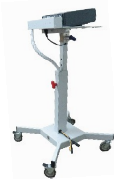
Keyboard And Mouse Pad shown removed if not needed

From your Cell Phone Images can be Displayed Wirelessly Full Size on any Monitor using A $30 Chromecast Dongle attached to any Monitor Chromecast Dongle and a Free Chromecast app downloaded to your Cell Phone