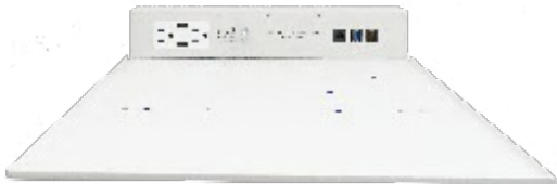
13" x 15" Platform with Control Panel Actual Platform size 13" x 13"