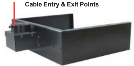
Pole Mount Version Junior Plenum Equipment Enclosure

Both the Cover and Front Panel can be removed at any time for easy access to the interior