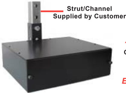
Unistrut Version Junior Plenum Equipment Enclosure