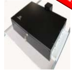
Extra Size Plenum Equipment Box with NB-CTSELB Ceiling Tile Supports

•Spans a Standard 2 ft Ceiling Grid (When used with our Plenum Boxes)