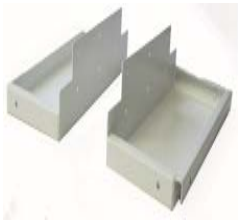
NB-CTSSPB Ceiling Tile Supports