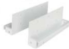
NB-CTSELB Ceiling Tile Supports