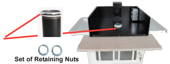
Set of Retaining Nuts