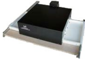
Standard Plenum Box with NB-CTSSPB Ceiling Tile