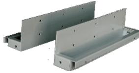
Ceiling Tile Supports For Extra Large 2U Plenum NB-CTSELB