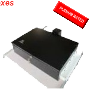
Extra Size Plenum Equipment Box with NB-CTSELB Ceiling Tile