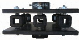
NB-UIM-96 Measures 6½ x 6½

All our Anti-Vibration Devices use a proprietary Visco-Elastic Polymer that flows like a liquid under load. Combining this fast reacting high energy absorption with a near faultless long Memory, guarantees it will outlast any other material, including all one dimensional materials like Rubber or Springs that are often used in an attempt to cure vibration. Rubber in particular has a short life and Springs will also lose their efficiency over a similar short time.