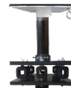
Ceiling Plate Comes with NB-UIM-W-96 & with NB-UIM-96 & Safety Cable