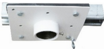
Ceiling Plate attached to Unistrut