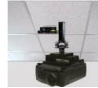
The NB-UIM Anti-Vibration Adaptor shown installed 3" above a projector's Mount.

All Ship completely assembled for instant attachment to the Projector's 1 1/2" Dia Pole