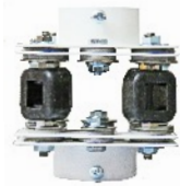
NB-UIM-15 to NB-UIM-60 Measure 4" x 4"