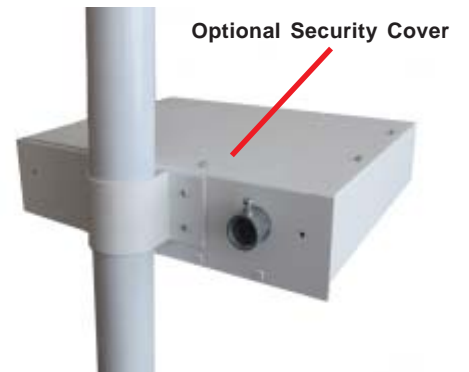
Unit shown with optional Security Cover

For Installations where Security is a concern, users can purchase the Pole Mount Enclosure with the Security Cover Kit NB-PESC-W that includes Tamper Proof Fittings making the entire unit and the installed equipment resistant to theft.