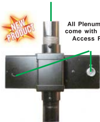
Cables can be run inside the Pipes Rear View of Junior Plenum Equipment Box with Double Pole Mount Fitting

All Plenum Boxes come with Conduit Access Points