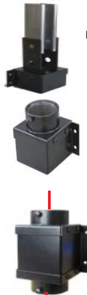
Built In 2 Position Power Receptacles

The new Double Pole Mount Fitting allows easy connection to a Projector or other Device using (2) 1 1/2" dia Poles