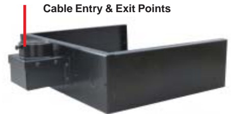
Cable Entry & Exit Points