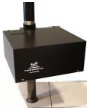
Pole Mount Plenum Box