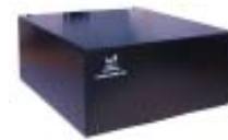
Hanging Version Plenum Box with Ceiling Tile Kit