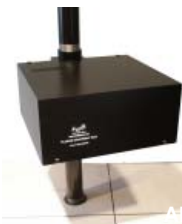
Pole Mount Plenum Box