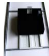
Ceiling Tile Kit with Plenum Box