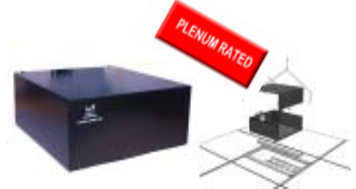
Hanging Version Plenum Box with Ceiling Tile Kit