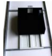
Ceiling Tile Kit with Plenum Box