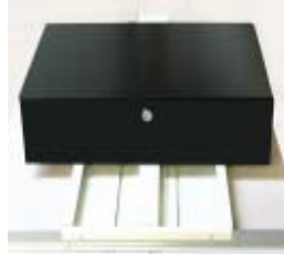
Using the Ceiling Tile Kit