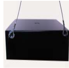
Using the Hanging Kit