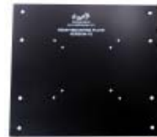
VESA Plate #2 Part # NB-MPB-V2 PARTS