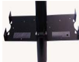
(2) Multi Purpose Brackets on Projector's Pole