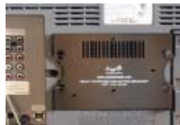
The Multi Purpose Bracket can be attached to the back of a TV or Monitor for vertically mounting an Amplifier