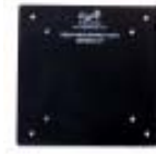
VESA Plate #1 Part # NB-MPB-V1 PARTS