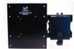
Amplifier Mounted on a Multi Purpose Bracket joined to a VESA Plate