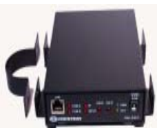
Crestron Controller on Pole Mount