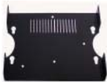
Joining Kit Part # NB-MPBJK PARTS