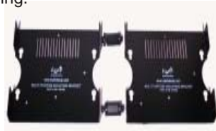
2 Brackets joined together when used on a 1 1/2 "Pole