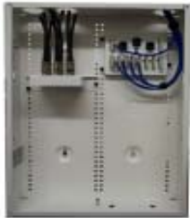
The Multi Purpose Bracket fits all Structured Wiring Panels

Note: The Adhesive Strip should be wrapped around to Pole before attaching the Pole Bracket to stop the bracket slipping.