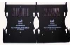
2 Brackets joined together when used on a Flat Surface